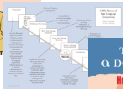
CSW's interpreting process.

ACSW Project for implementing a training session for teachers/tutors in education.