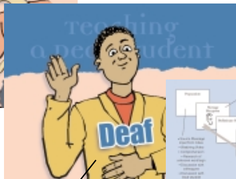
Deaf awareness in the classroom

ACSW Project for implementing a training session for teachers/tutors in education.